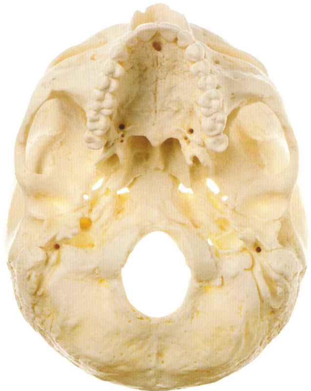
Illustration of the skullbase from below. The structure of the bones is identical to the models QS 2, QS 2/1, QS 7 and QS 7/1

Natural cast, in SOMSO-Plast. Removable vault, lower jaw movable. Life-like reproduction of the bony skull. Separates into 3 parts. Length: 17.5 cm., width: 14,1 cm., size: 51.2 cm., weight: 800 g